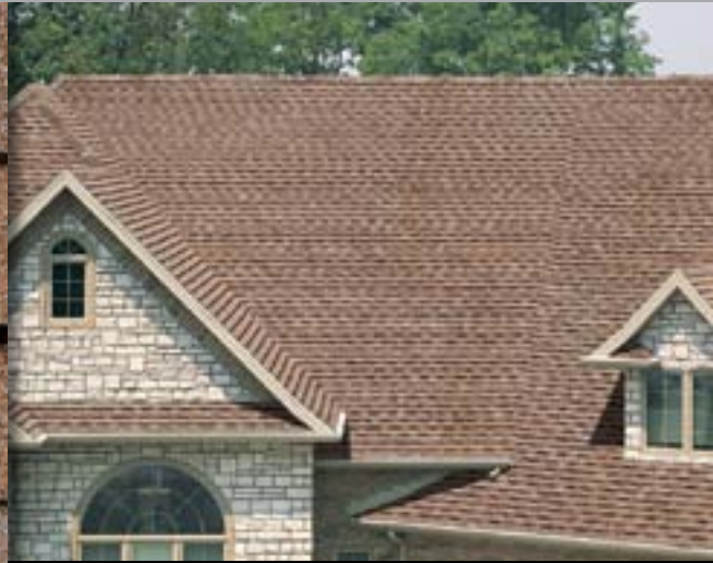
DESERT SAND CLASSIC HERITAGE COLORS