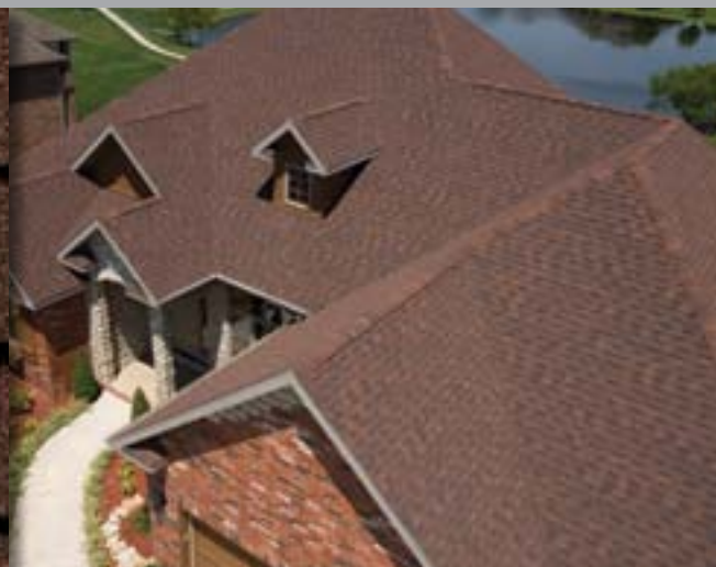
RUSTIC HICKORY • CLASSIC HERITAGE COLORS