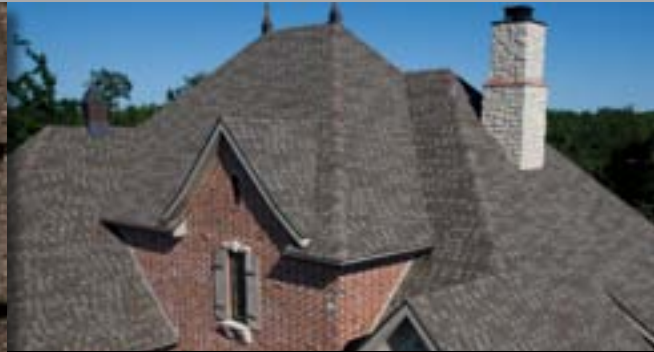
NATURAL TIMBER AMERICA'S NATURAL COLORS