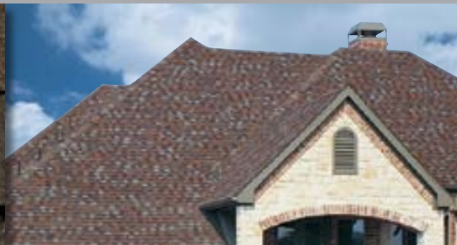
MOUNTAIN SLATE AMERICA'S NATURAL COLORS