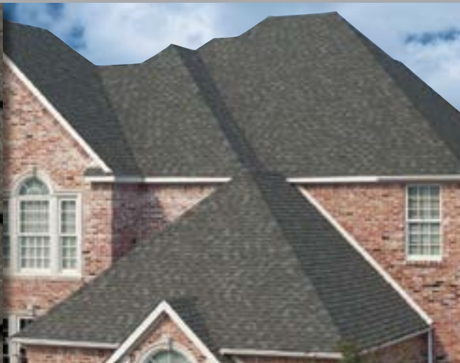
OXFORD GREY CLASSIC HERITAGE COLORS