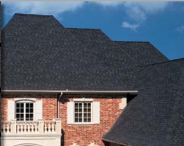
RUSTIC BLACK CLASSIC HERITAGE COLORS