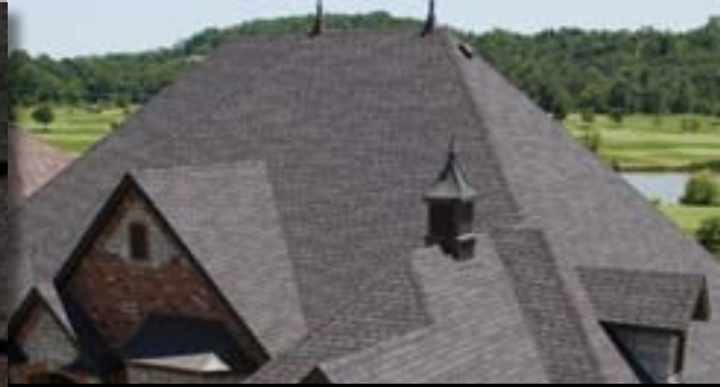
BLACK WALNUT AMERICA'S NATURAL COLORS®