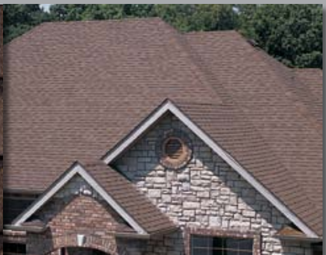
RUSTIC SLATE CLASSIC HERITAGE COLORS