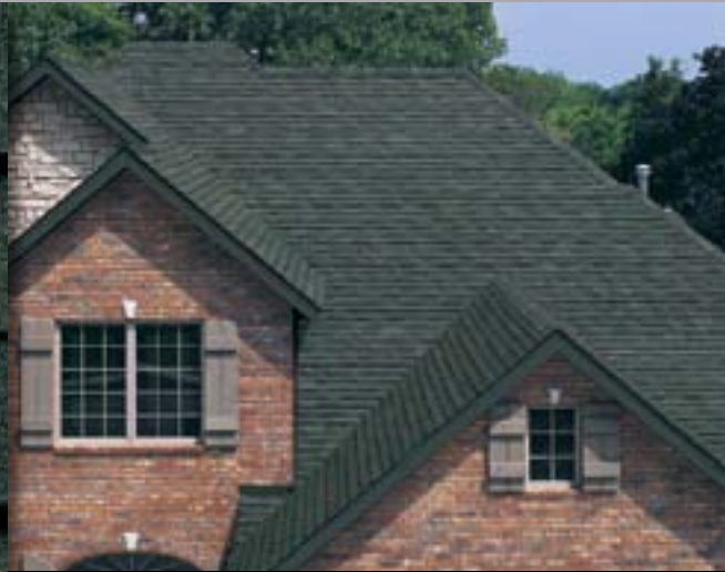
RUSTIC EVERGREEN CLASSIC HERITAGE COLORS