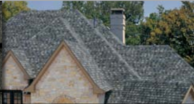
THUNDERSTORM GREY AMERICA'S NATURAL COLORS