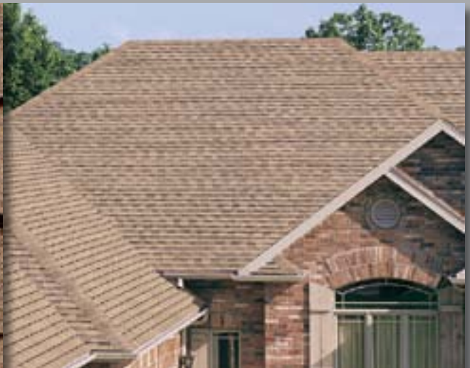
DRIFTWOOD CLASSIC HERITAGE COLORS