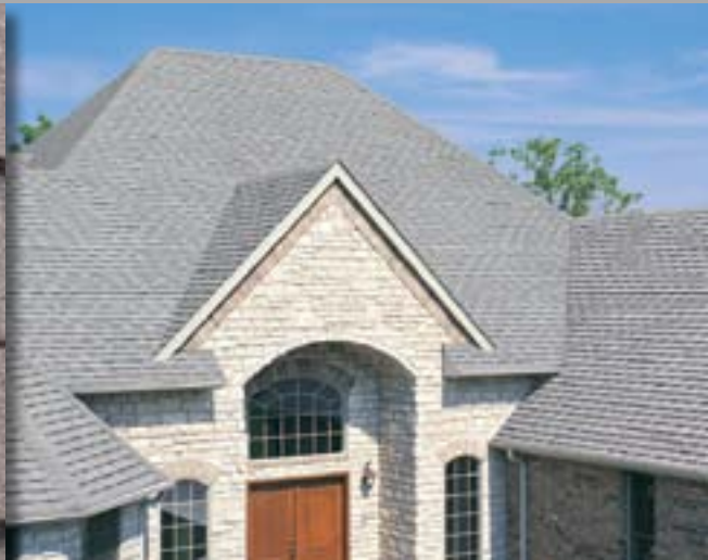
GLACIER WHITE • CLASSIC HERITAGE COLORS