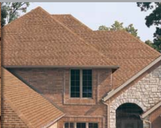
RUSTIC CEDAR CLASSIC HERITAGE COLORS