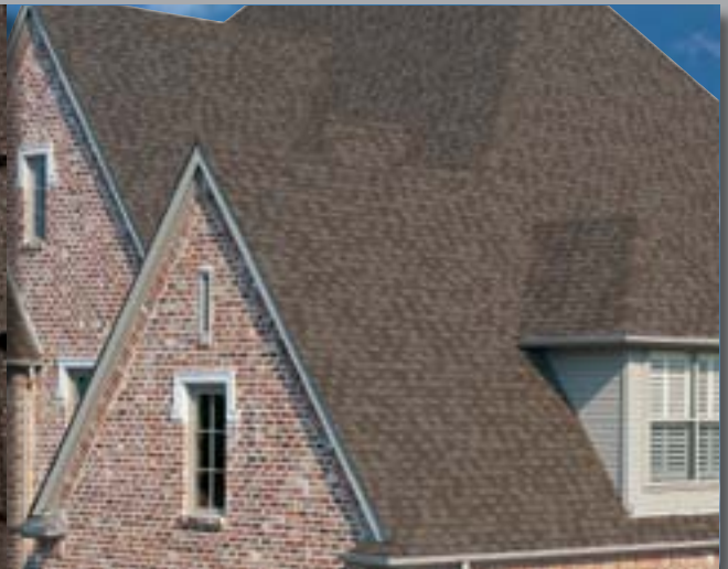
WEATHERED WOOD CLASSIC HERITAGE COLORS