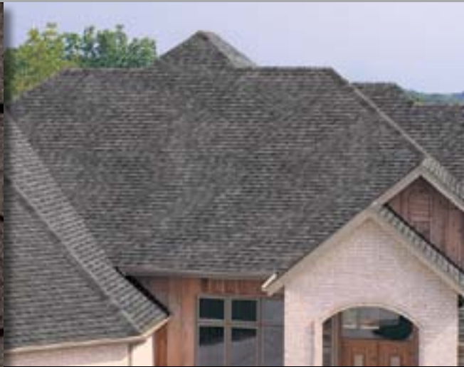
SHADOW GREY • CLASSIC HERITAGE COLORS