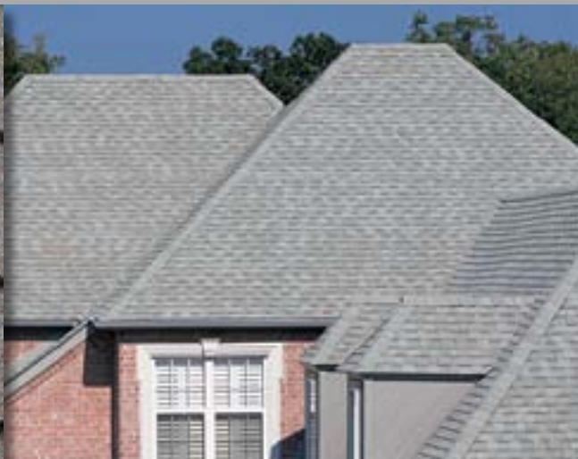
OLDE ENGLISH PEWTER CLASSIC HERITAGE COLORS